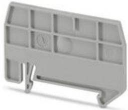
Partition plate, length: 59.8 mm, width: 2 mm, height: 39 mm, color: gray

Please be informed that the data shown in this PDF Document is generated from our Online Catalog. Please find the complete data in the user's documentation. Our General Terms of Use for Downloads are valid ( http://phoenixcontact.com/download )